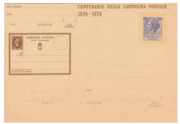
First italian postal card commemorated on the centennial issue

stationery of the Italian State, however, were the two postcards issued in 1874: the single for 10 cents and the one with paid reply for 15 cents. The study of the stationery over time allows to analyze the technical evolution and the changes in graphic design and to trace a history of the Italian nation with its political, military and administrative events.