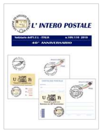
L'INTERO POSTALE magazine celebrating the 40° anniversary of UFI-Italia. On the cover postal cards with celebrative private printings

To communicate with the members, the association initially used a philatelic magazine of the time, the ASIF Newsletter, published in Turin, where a couple of pages were reserve for this intention.